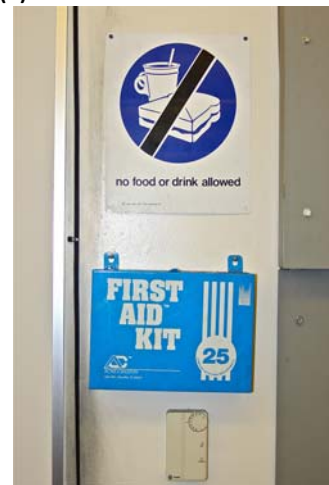
Figure 2: (A) Fire pull and fire extinguisher. Note: If you pull the fire alarm due to an emergency you must also call 911 to make sure the fire department has been alerted. (B) First Aid Kit located at the front of every classroom.