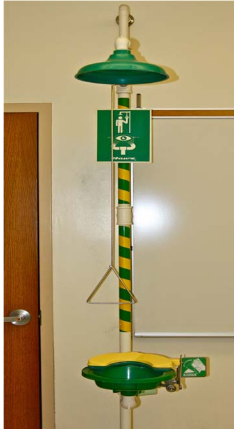
Figure 1: Safety shower/eye wash combination located in the front of every classroom.