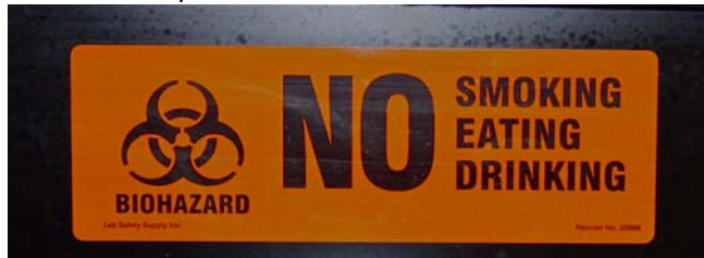
Figure 3: Biohazard signs posted in Labs dealing with hazardous chemicals or microorganisms. Absolutely no eating or drinking at any time.

There should be absolutely no food, drink or open food containers in the microbiology lab (figure 3). This includes chewing gum. If you need a short break, carefully wash your hands, remove the lab coat and leave the laboratory.