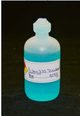
Figure 7: Lab disinfectant.