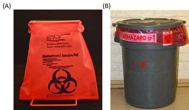
Figure 5 : (A) Dispose of culture tubes and plates in small red biohazard bag bags , secure bags then dispose of them in the larger biohazard container (B).

All cultures must be disposed of in the red Biohazard labeled bags and Biohazard disposal can (figure 6). Chemical waste including stain waste must also be disposed of in the proper collection container (figure 7). You will be further instructed in all proper laboratory and disposal procedures and will be expected to know and follow those procedures.